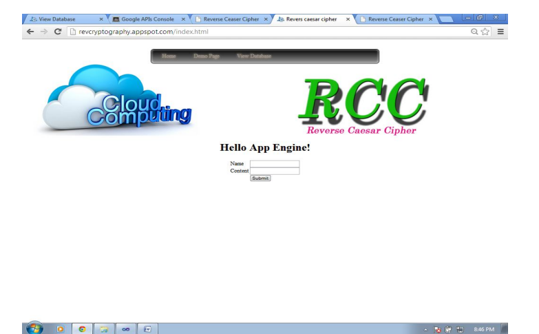
Figure 3. App Engine Encrypted Database