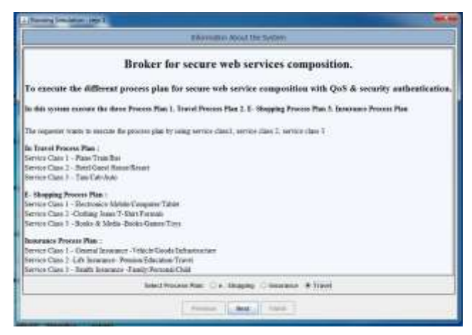
Screenshot 1: Main window of Broker

This broker application is developed in the Java by using database which is created into the MySql. Here, taking the three process plan 1. Travel process plan 2. E – Shopping and 3. Insurance process plan for the Broker, when we execute this it extract the values of QoS and specified encrypt parameter as well as security authentication methods.