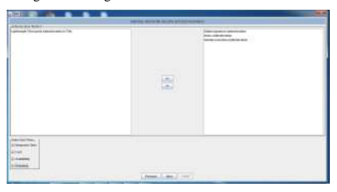
Screenshot 3: Selecting Security Authentication & QoS The selection of different web services from S1,S2 and

are taking Security Authentication methods Digital Signature Authentication, Basic Authentication & Identity Assertion Authentication. It checks which web service having same through S1-S2-S3 service classes.