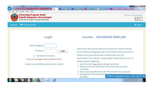
Fig. 3 Course setup on Moodle platform

In order to apply blended learning, English course lecturer required to set up the course on Moodle first. It is exemplified in the following figure.