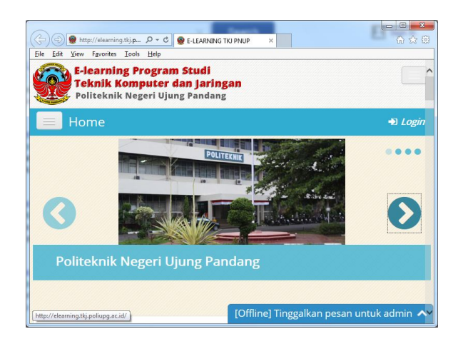
Fig. 2 Moodle as LMS Platform

Considering its many advantages and requirements from faculty members, a new initiative to apply LMS was started in our institution in 2007. Moodle was chosen considering its wide user and active community in the world as well as in Indonesia .