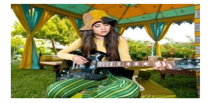
Figure 4: Stego image

Higher PSNR (Peak Signal-to-Noise Ratio) [11] indicates that the steganography images are of high feature and does not hunt for the interest of the intruder because if zilch image artifacts. MSE (Mean Squared Error) and PSNR (Peak Signalto-Noise Ratio) are given by: