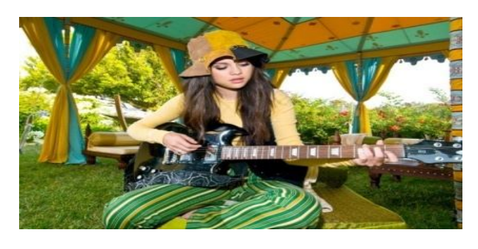
Figure 3: Original image

The technique was implemented and tested in java. The technique accepts all mainly JPEG, PNG; BMP images of size 260×349.We can select a bmp image for testing the proposed Enhanced PIT algorithm. The PIT method is compared with the Stegoimage-1bit, Stegoimage-2bit, Stegoimage-3bit, Stegoimage-4bit. The approximate BMP image size used is 512 X 384 used to veil a text message of 11,733 characters length. The algorithm is used to hide 1-bit, 2-bits, to find the effect of transparency, security and capacity. Tests results showed different levels of diagrammatic inspections and histograms based study. For influence obligation the numbers of pixels used are recorded in each trial run.