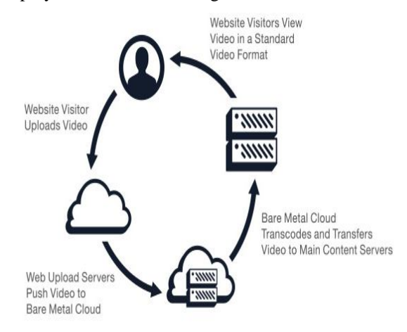
Figure 1: Meta cloud over view

Here, we say the concept of a Meta cloud (figure 1) that incorporates the design time and runtime components. In Meta cloud would abstract away from previous offerings' technical incompatibilities, thus explanatory vendor lockin. It helps clients search the perfect set of cloud services for a specific use case and helps an application's starting deployment and runtime migration.