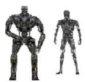
Figure 1: Robots