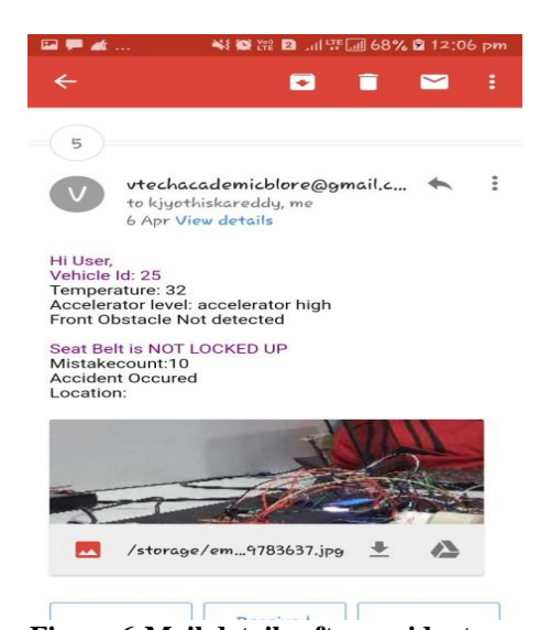
Figure 6:Mail details after accident.

The Figure 5 additionally speaks to the LCD show after the mischance recognition with the every single concerned factor