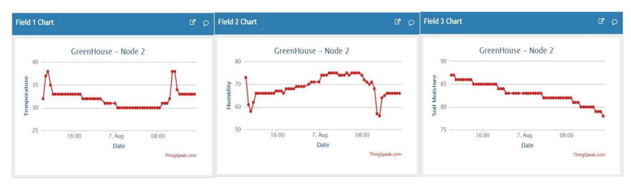
Fig 3: The visualization of the sensing data of a control unit through web pages