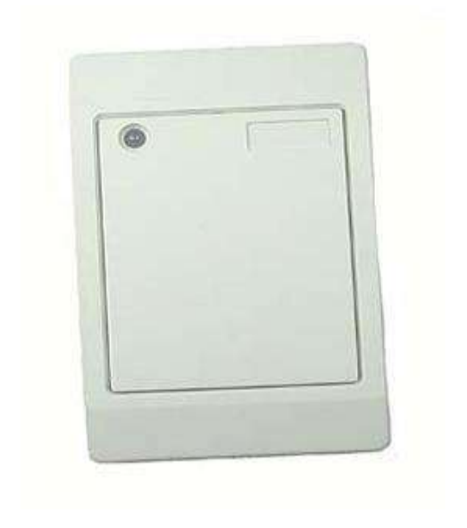
Fig 3 RFID reader

2. A reader: It consists of a scanner with antennas to transmit and receive signals and is responsible for communication with the tag and receives the information from the tag as shown in Fig 3.