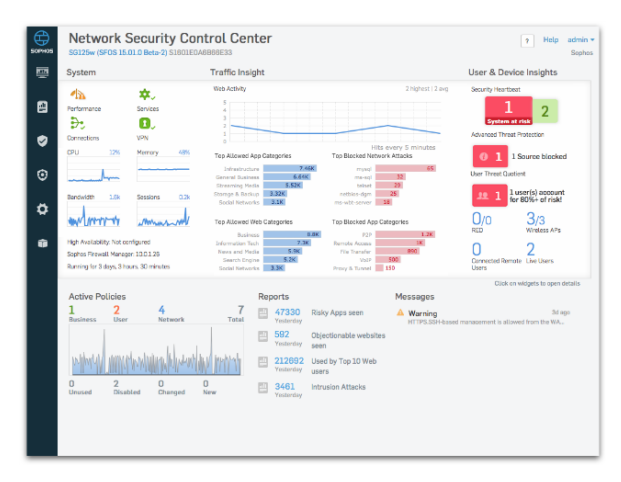
Fig.1: SOPHOS - Example of UTM

The security tools that currently exist are performing and respond well to the needs, but the problem is how to use these tools? How to minimize the human factor? For example, if the administrator forgets to shut down a vulnerable service, or leaves a critical folder with type 777 permission, how do you resolve these problems?