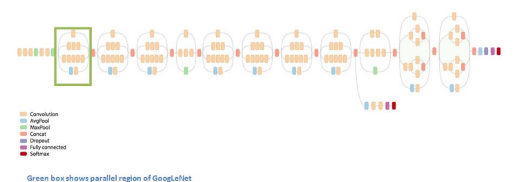
Figure 3 Architecture of Google LeNET [7]