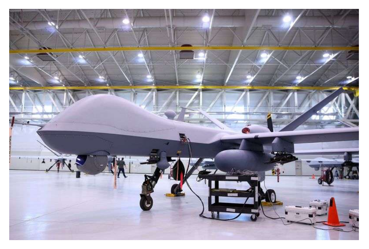
Figure 1 The use of drones by the US is seen by some as a prelude to the deployment of autonomous weapons — allowing nations to conduct war with little fanfare or attention.

Likewise, there comes a time when a certain moral belief is hampering you to perform a task on call of duty. Machines can do what ought to be done.