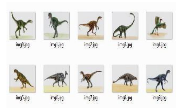
Fig 2: Top 10 Retrieved images for RGB colors space based on similarity comparison