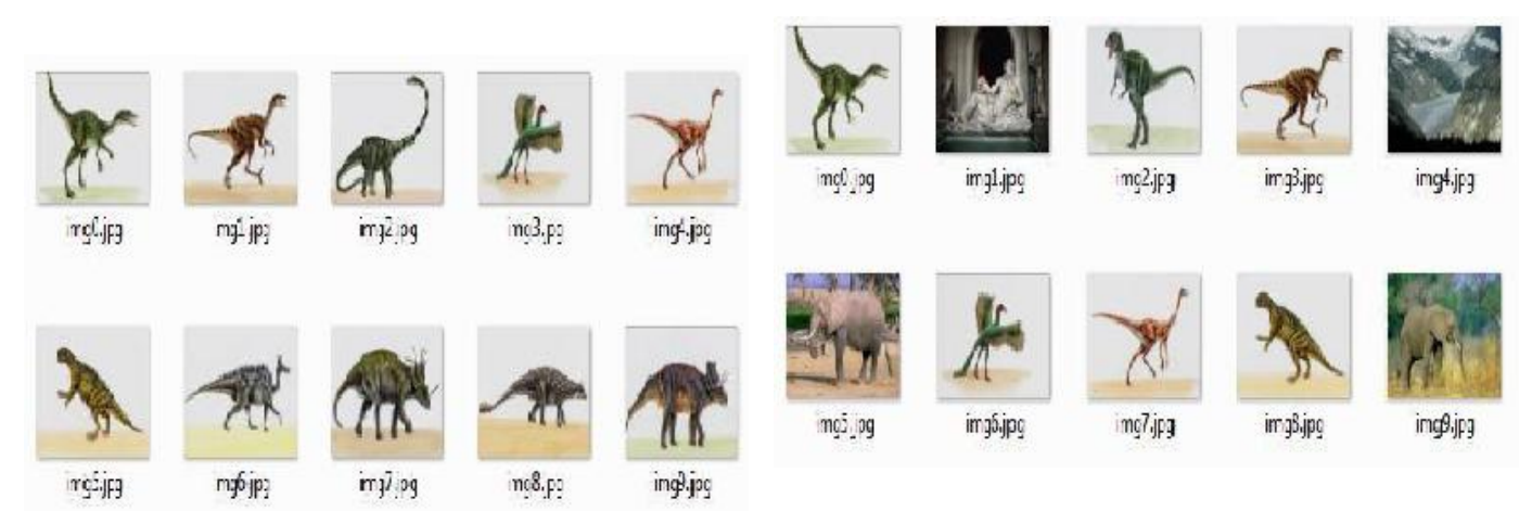
Fig 3: Top 10 retrieved images for HSV color space based on similarity distance.