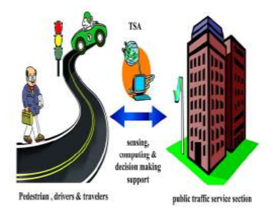
Fig. 1 illustrates the modules of ITS and exhibits that the TSA plays the role of sensing, computing, and supporting the decision making in ITSs.

TSA is a subfield of sentiment analysis, which concerns in regards to the issues of visitors in certain. Because of the subject sensitivity of sentiment evaluation, it's necessary to discuss the TSA procedure in brief with its working. For the completeness of ITS space, it is critical to accumulate and analyze the general public knowledge and opinions. With the super development of web 2.Zero in the final decade, verbal exchange platforms, corresponding to blogs, wikis, on-line boards, and social-networking companies, have end up a rich information-mining source for the detection of public opinions. Thus, we endorse site visitors sentiment analysis (TSA) for processing visitors know-how from websites. As taking consideration of human affection, TSA will enrich the efficiency of the current ITS area. The TSA treats the traffic issues in a special approach, and it dietary supplements the capabilities of present ITS methods [7].