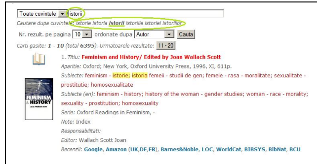
Figure 5. Search with the word “istorii” (histories) with derivation

Finally, using a global inverse index that includes all the possible search terms that are found among the metadata further enhances the efficiency of the information retrieval process in the NECLIB2 digital library. Fig. 5 shows a small portion of this index, where one can identify all the resources that have the subject istoria religiilor (namely, history of religions , in English).